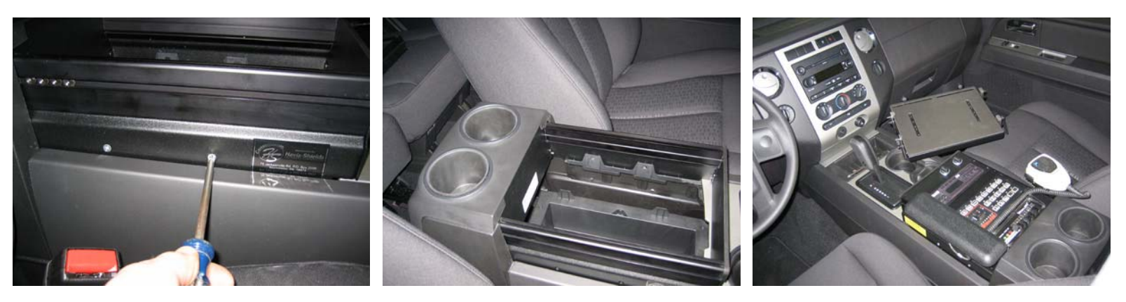
Install #10 x <sup>1</sup>/<sub>2</sub>" machine screws and keps nuts as shown above